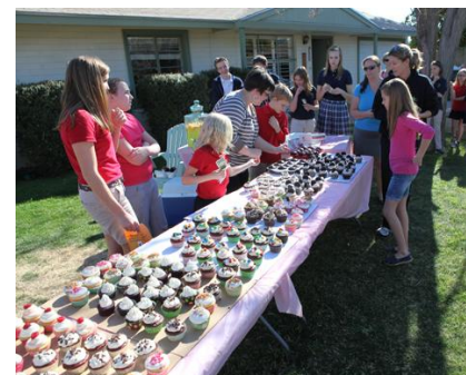
The Meyerson's Cupcake Stand: Very sweet!